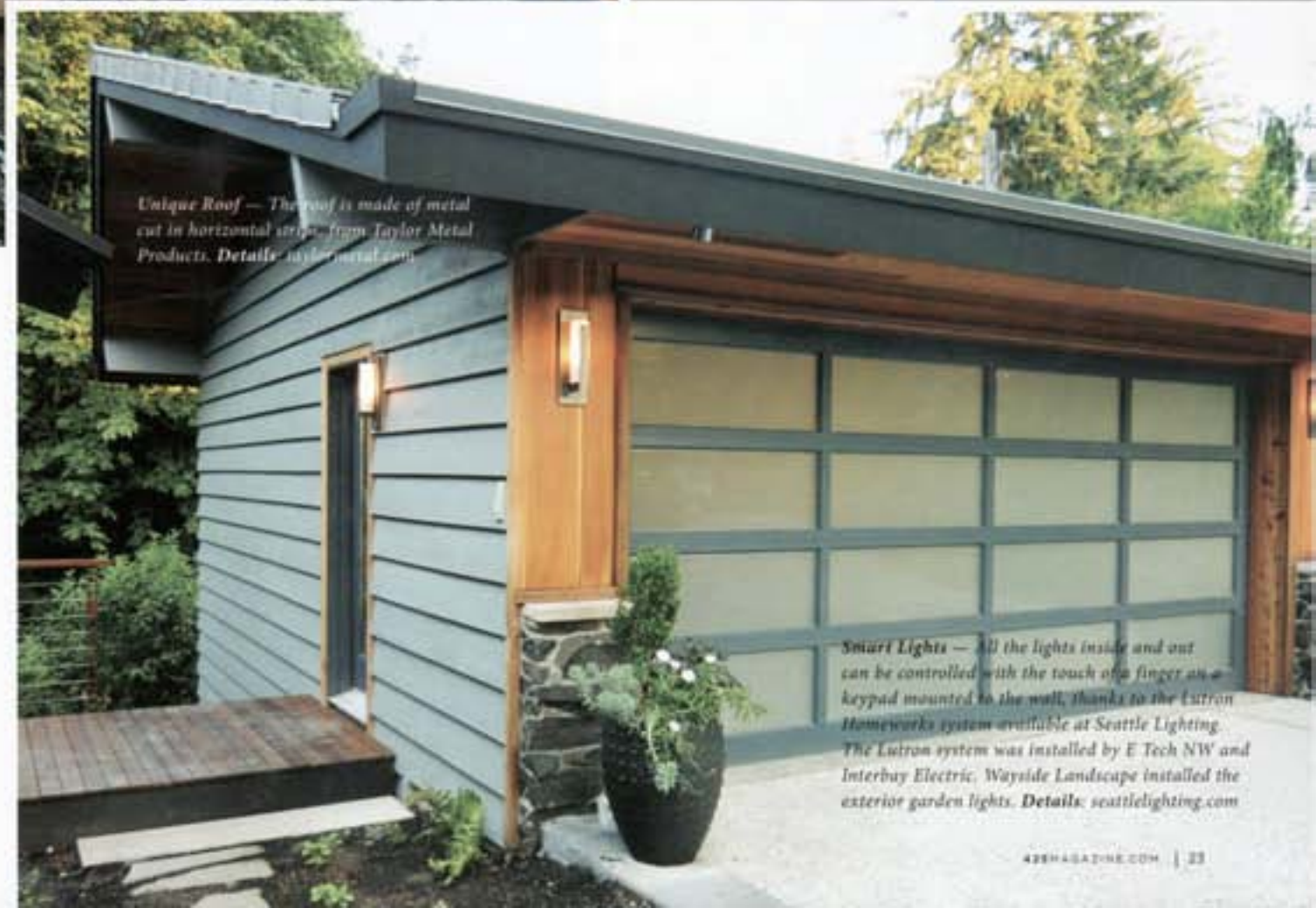
Unique Roof — The roof is made of metal cut in horizontal strips — from Taylor Metal Products. Details: taylormetal.com