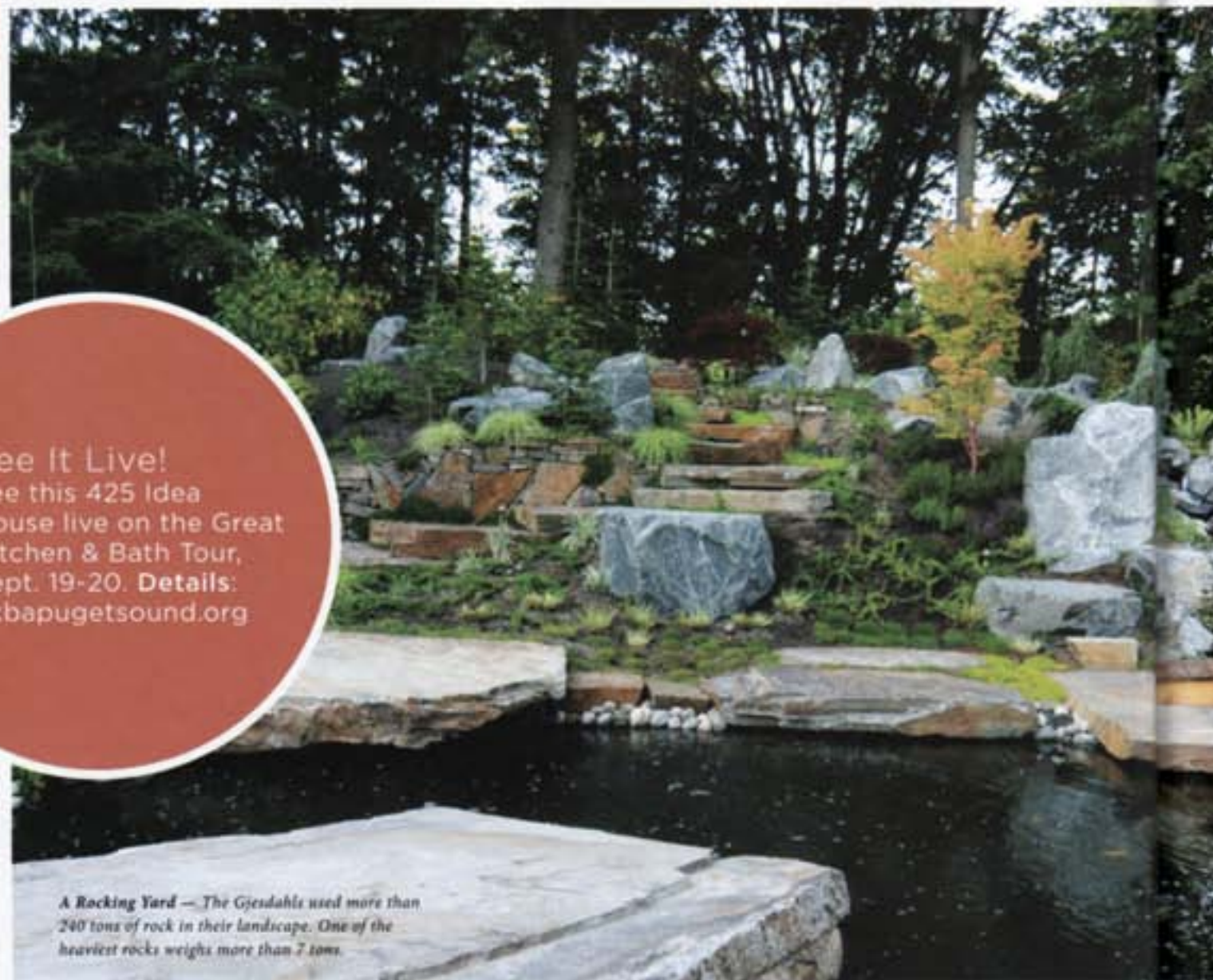
A Rocking Yard — The Gjesdahls used more than 240 tons of rock in their landscape. One of the heaviest rocks weighs more than 7 tons.

See It Live! See this 425 Idea House live on the Great Kitchen & Bath Tour, Sept. 19-20. Details: nkbapugetsound.org