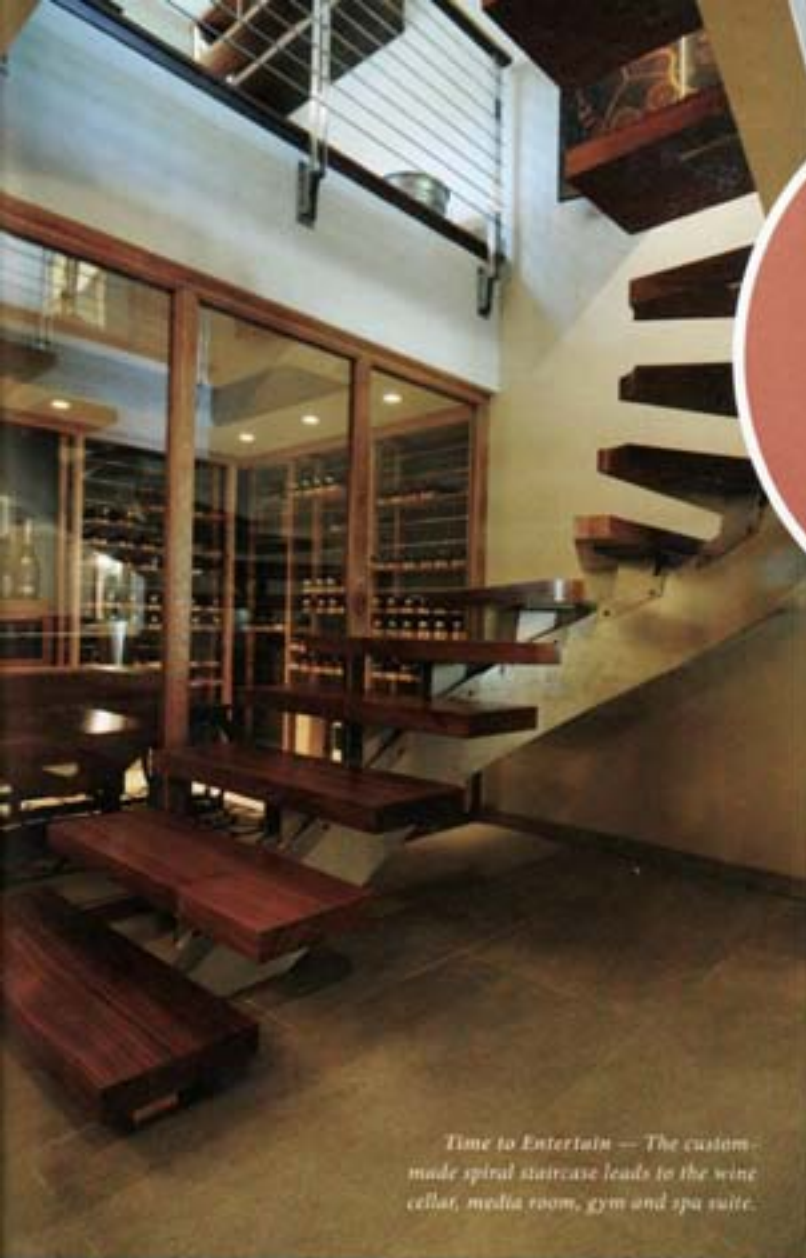
Time to Entertain — The custom-made spiral staircase leads to the wine cellar, media room, gym and spa suite.

The cellar holds about 800 bottles of wine and includes a wine-tasting area and display shelves.